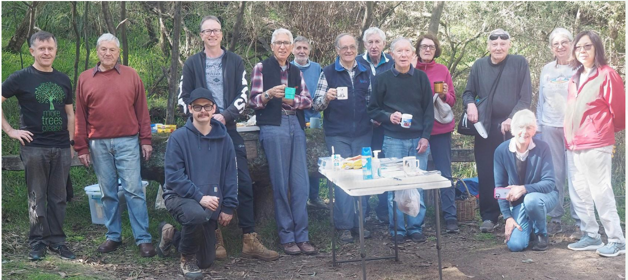
Our team relaxing after working in the Fern Gully April 30 th