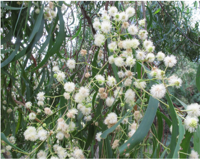
Acacia implexa (Lightwood)