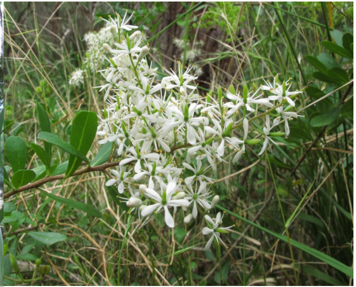
Bursaria spinosa (Sweet Bursaria)